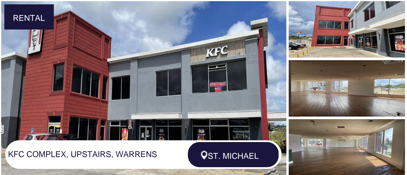
KFC COMPLEX, UPSTAIRS, WARRENS ST. MICHAEL